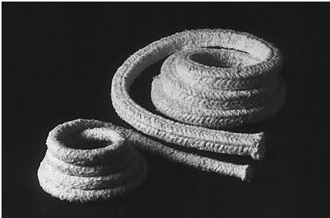
Fiberfrax Round and Square Braid