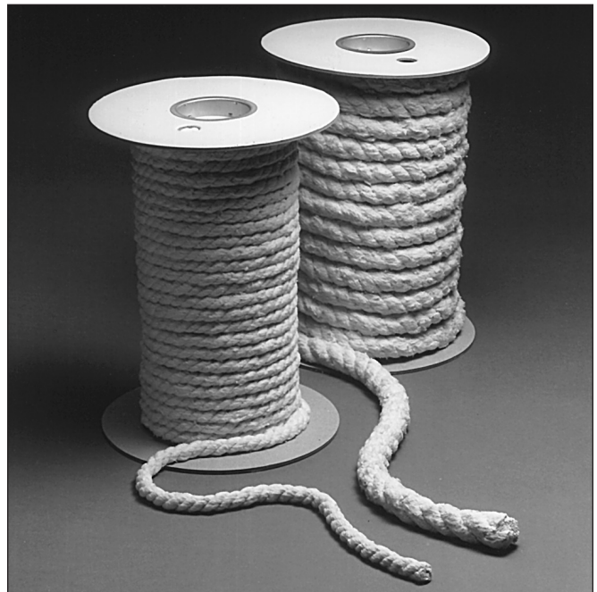
Fiberfrax Rope and HD Rope

Refer to the product Material Safety Data Sheet (MSDS) for recommended work practices and other product safety information.