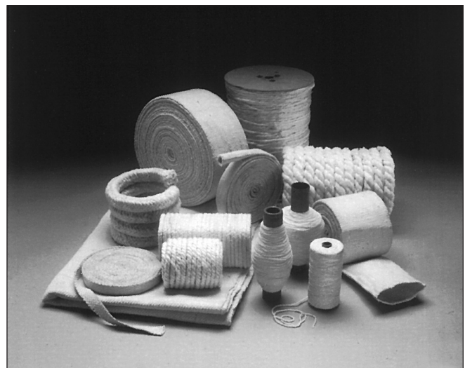
Fiberfrax Woven Textiles Product Family

For additional details on the available woven textile product forms, typical properties and applications for which they are appropriate, refer to Fiberfrax Woven Textiles, Product Information Sheet, Form C-1425.